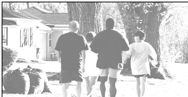
Pinckney Neighbors Walking the Neighborhood!

Note: There may be a SPECIAL GUEST for the Sept. 8th Walk Pinckney event.