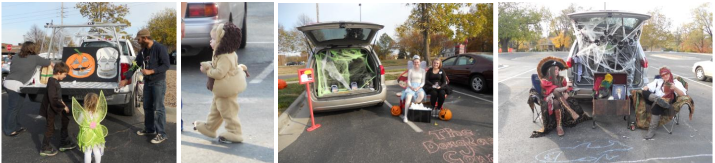
Just a few pictures from the Trunk-or-Treat - more photos available for viewing on the PNA Facebook page.

2011 Trunk-or-Treat & Food Drive Success! PNA's first ever Trunk-or-Treat and food drive for Just Food Douglas County was a great success. We counted 14 vehicles and booths and approximately 75 attendees. Thanks to the generosity of Pinckney residents, we also collected 135 pounds of food for the food bank.